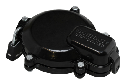
WTCC-Cxxx Cast Iron Series