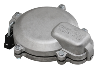
WTCC-Axxx Aluminum Series

ASSE Standard #1093-2019 & WSC Standard PAS-97 (2019)